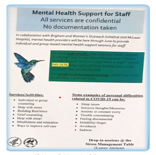
Shiprock Hospital Poster

Harvard Medical School Dean's Community Service Award April 2022 for McLean Hospital Collaboration with BWH Outreach Program with Indian Health Service (IHS)